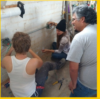
2 New Female Apprentices