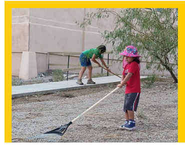
Team 3N Otis