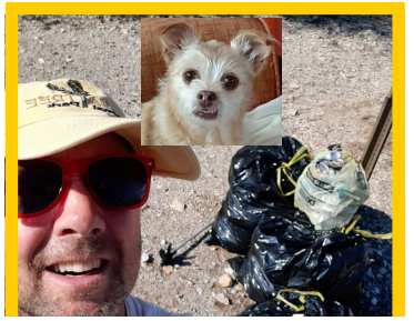
Team Peach Pop